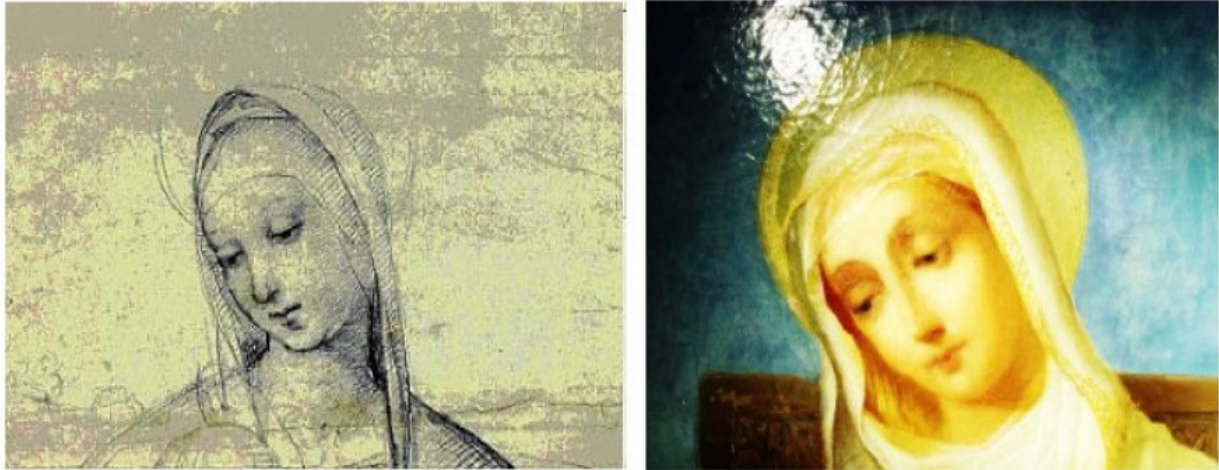
Stylistic comparison Raphael - Renoir

It was a very handsome and painting with just under 120 cm in height but very impressive. However, as I at this time was more on Impressionism from the painting I went to heedlessly, without further notice to it and saw other works of art to me.